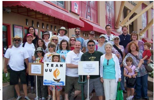
Five local UU congregations, including families from UUFLB, earned donations in the AIDS walk again this year. UU's walked all together! (See larger photo back of Calendar inside.)